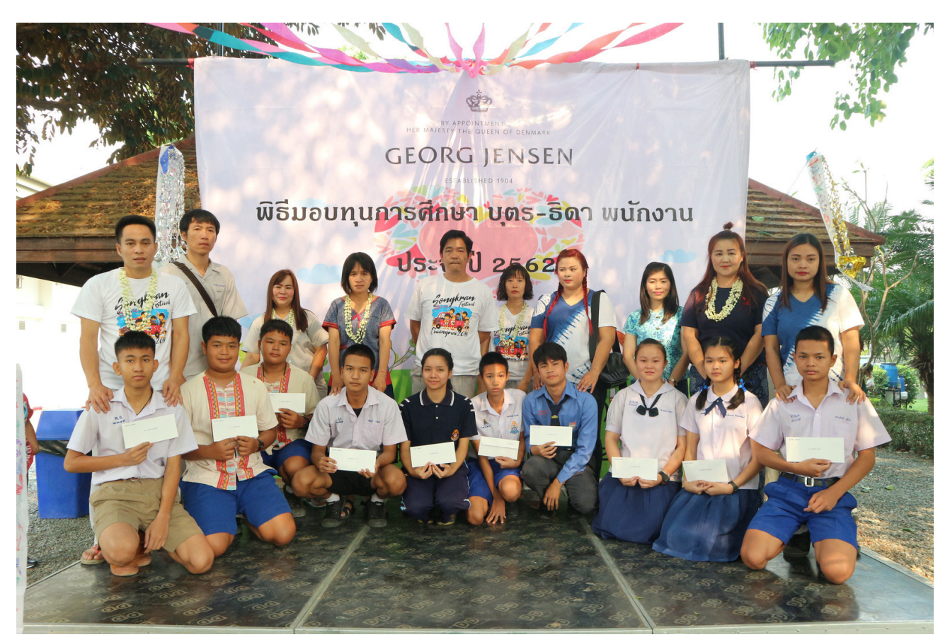
Picture of employees in Chiang Mai working on CSR projects mentioned above

We perceive ourselves as a contributor to the society in which we operate which is why we have a focus on CSR activities contributing to the local community. Among others, the local community projects cover renovation at a local temple in the community as well as canal cleaning in front of the factory area. The projects are proposed by our employees, making sure that they also have a voice in what Georg Jensen act on. Additionally, we donate to charity projects such as rural villages, and on "Buddhist Lent Day" all employees visit the local temple to engage in various rituals and give donations. One day a year, our employees also engage in "Plant for the Planet" with the purpose of reducing global warming while planting trees around the local community. Protecting the environment as well as workers, and caring for the local community in general is fundamental to us at Georg Jensen.